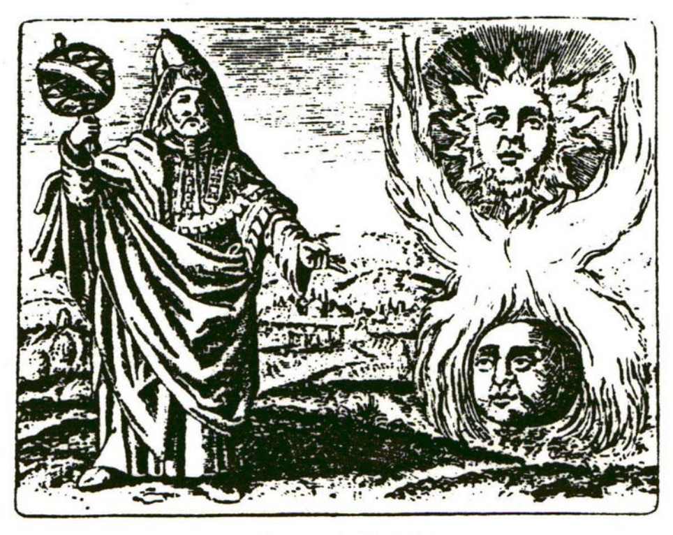
Hermes the Egyptian.